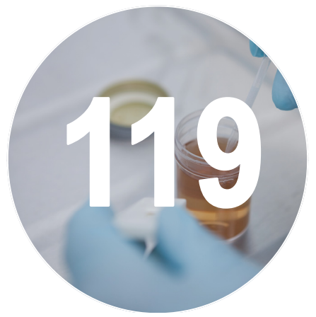
drug treatment cures for breast cancer