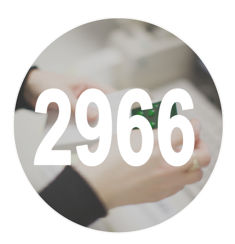
drug treatment courses for Alzhiemer's